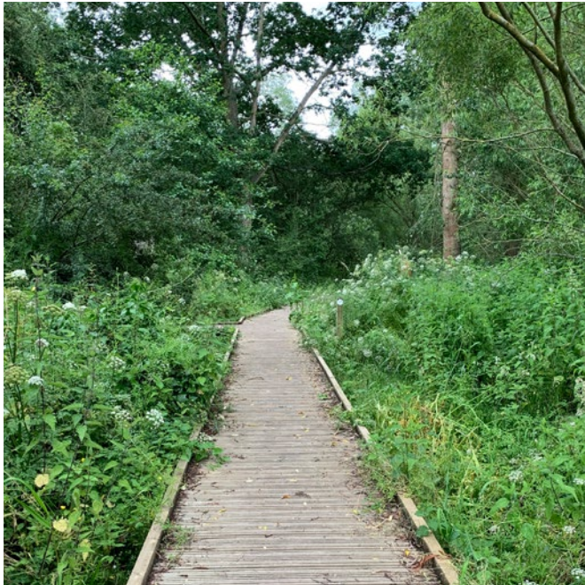
The wooden walkway in the Loddon Nature Reserve

12 Cross the bridge to get to a T-junction and a Loddon Nature Reserve sign and then turn left onto the path here. Follow this path with the lake to your right for a while as it turns into a wooden walking platform for a section before turning back into a normal footpath. After about 500m there is a fork in the path. Take the right turning at this fork.