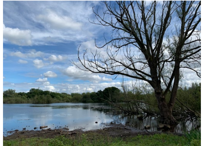
Another lake in the Charvil Country Park

15 When you reach the next bridge, cross it and then follow the path for another 50m or so until it emerges into the Heron on the Ford car park.