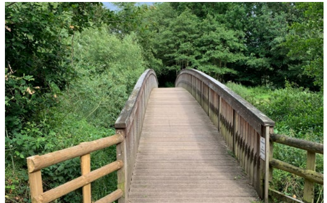
A bridge into Dinton Pastures Country Park

09 After about 100m this footpath meets a cycle track that is heading down to your left. Walk straight ahead onto this cycle path and follow it until it bends to the left and then hits a T-junction. Turn right at this T-junction and walk straight ahead on this concrete track.