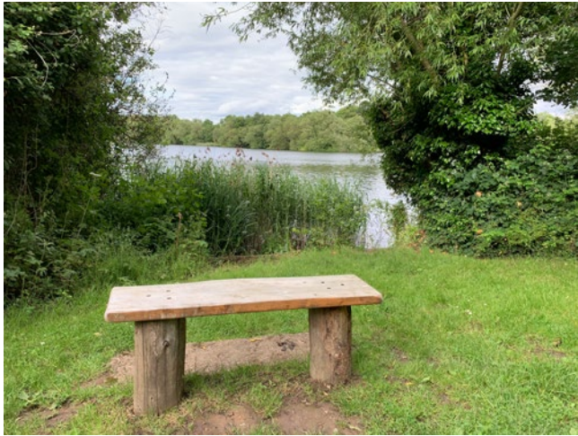
Enjoy the lakes at Dinton Pastures