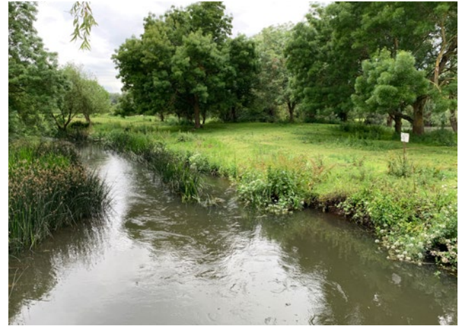
View of the River Loddon

15 This path then emerges onto a busy road (Sandford Lane). Cross this carefully and then go through a gate on the other side (slightly to your right) onto another footpath. At the immediate fork in this footpath take the left fork and walk on ahead with the River Loddon on your left.