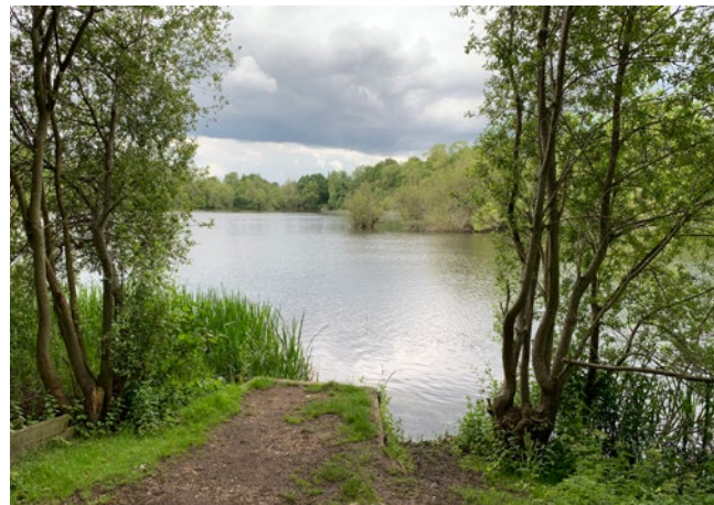
One of the lakes in Charvil Country Park

09 Follow this path for another 200m with the lake on your right through the trees until you reach another fork in the path. At this fork, take the right path and continue to follow this path for another 200m as it takes you between two lakes, with plenty of spots to stop and enjoy the water and wildlife.